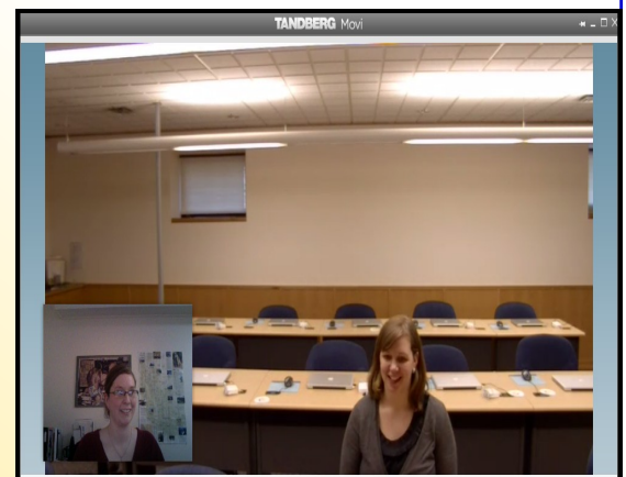
Stay connected with colleagues!