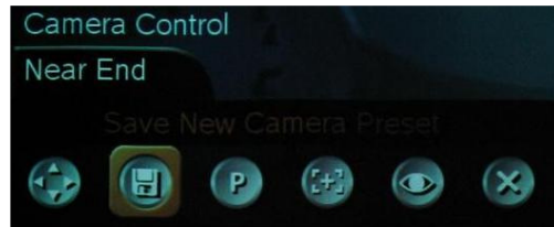
Save New Camera Preset icon (Camera Control menu)