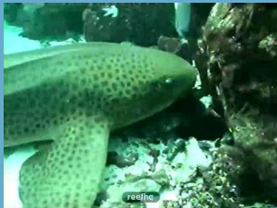
A resting Leopard shark

Beyond its size, this aquarium is also unique "because it is open to the elements. This means the many thousand reef organisms that are housed there receive natural day and moonlight and experience rain and storm events like natural reefs do."